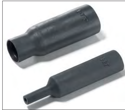
313E445-457 Series supplied / fully recovered.

This part is normally used to build up or shim a cable diameter to facilitate a better fit for components in a cable harness.