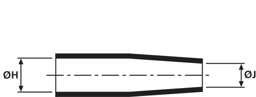
a: Expanded form (supplied)